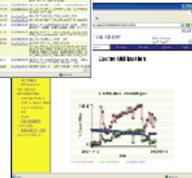
Performance Tools Screen Shot

And with flexible monitoring and notification features, you can keep tabs on whatever system events are important to your organization.