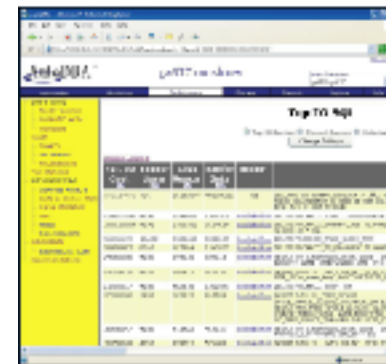
Query Tuning Screen Shot

AutoDBA also has productivity tools for things DBAs like to do themselves, such as advanced tuning, reporting, trouble-shooting, and diagnostics.